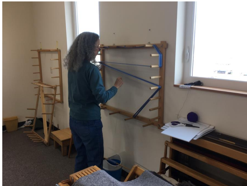
Warping the linen – wall mounted warping board