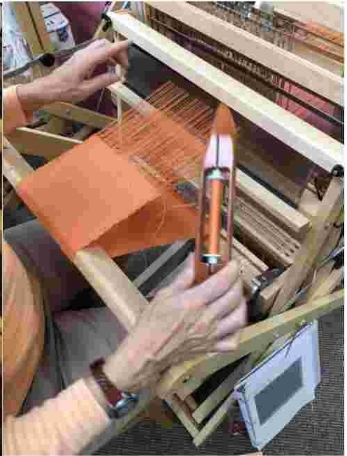
Linen projects in various colors and yarn sizes.