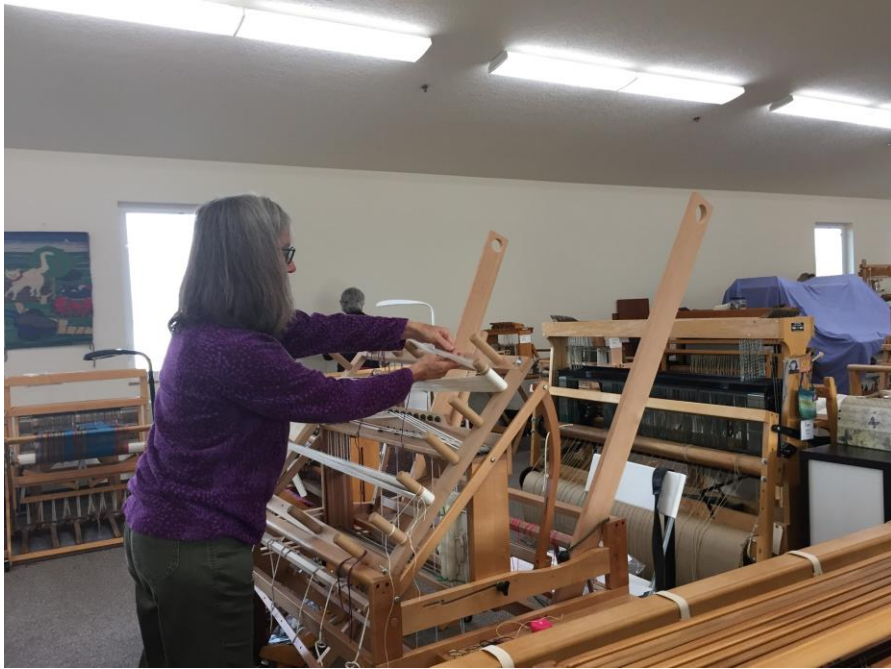
Warping by placing the board on the loom