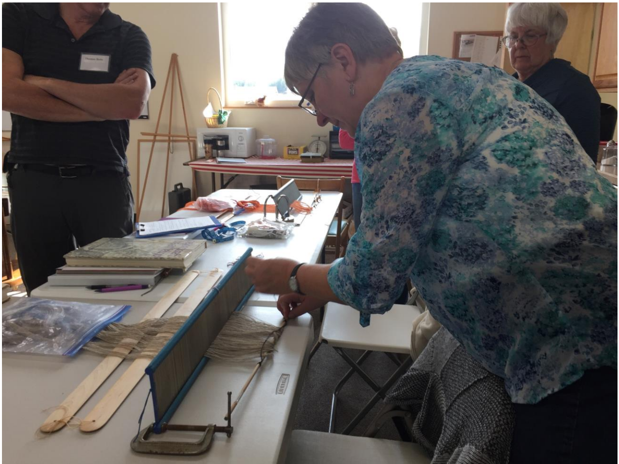
Pre-sleying the reed