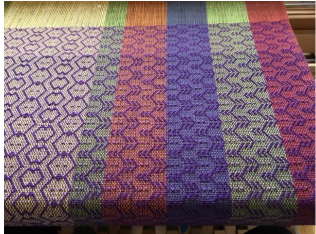
Above: 16/2 twill cotton napkins