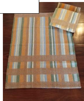
Susan Binford's Turned Taquete towels in 8/2 cotton based on Yosemite color palette.