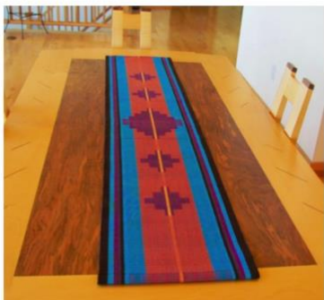
Grand Canyon National Park Table Runner in Rep Weave