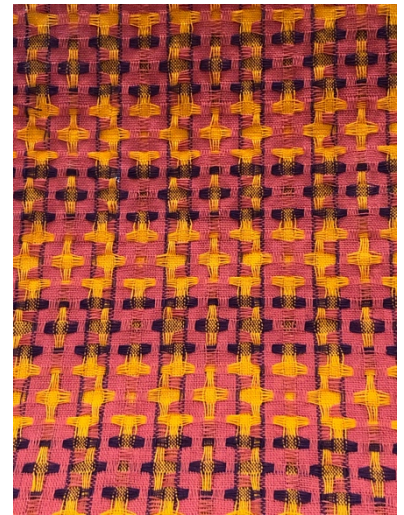
Towels woven by Shari Trout 22/2 cottolin