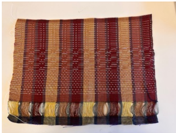
Unpulled Woven sample

Program: Dianne Totten presented "From Cone to Clothing, One Weaver's Journey" in conjunction with workshop she taught the following three days.