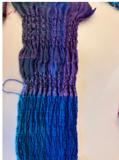
A sample that has been pulled