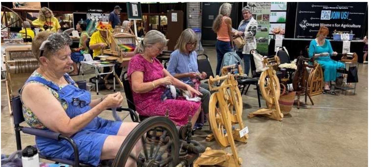
Aurora Colony Handspinners' Guild spinning circle