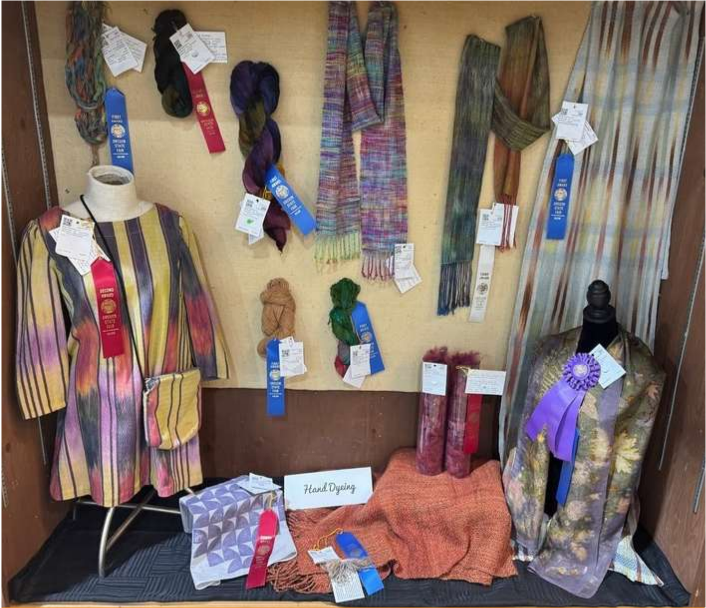
Hand Dyeing Ribbon Winners