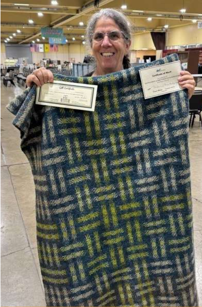
WeGo Certificate of Merit