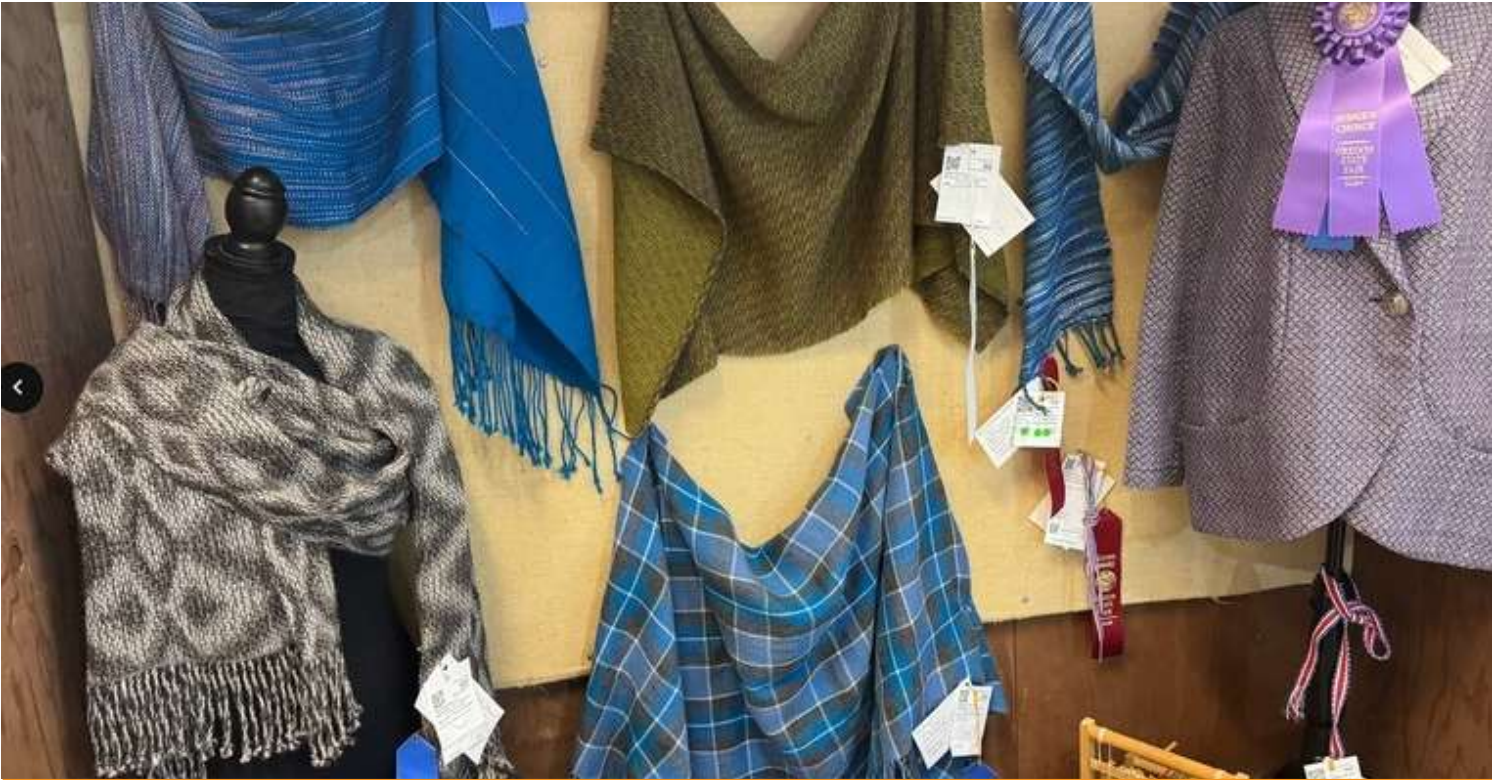
Ribbon Winners: Handwoven Articles