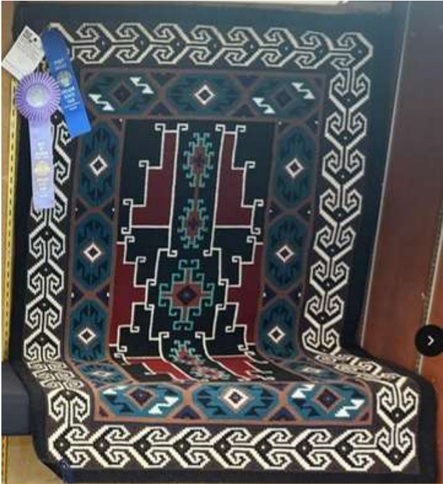
Best Handspun Yarn