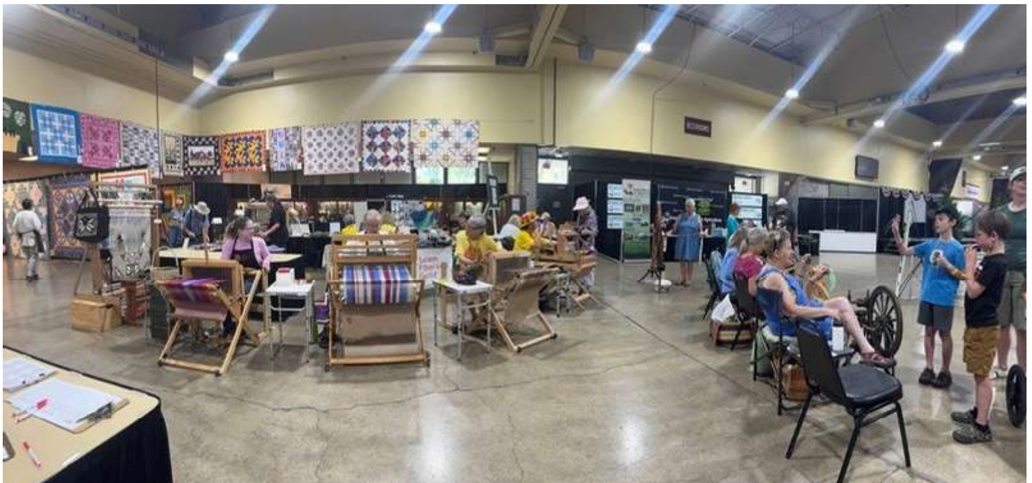
Panarama of the Fiber Art demonstration area