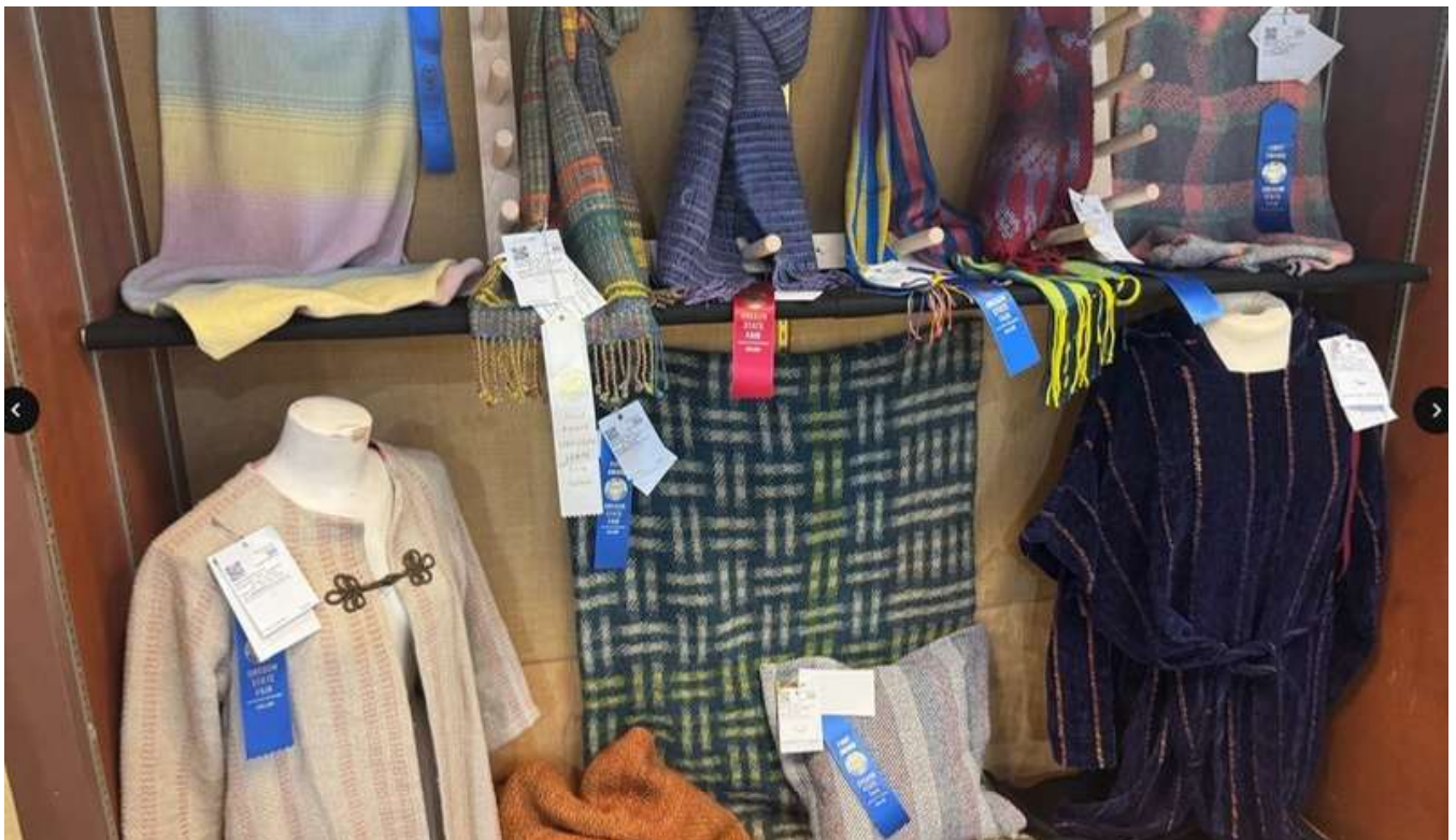
Handwoven Articles Ribbon Winners