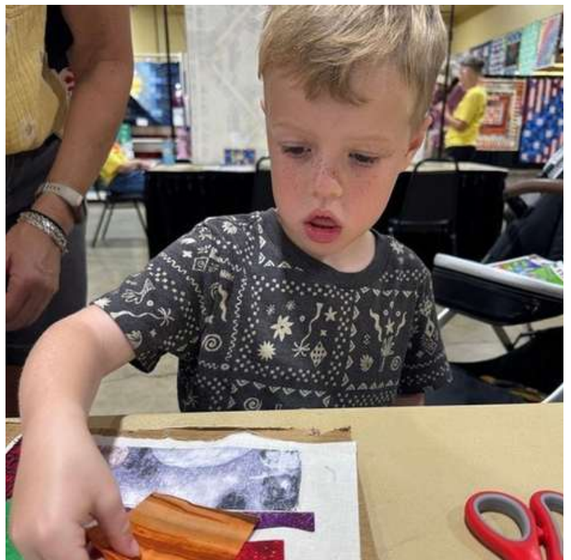
Make and Take fabric collage