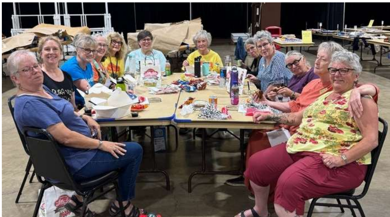
Fiber Arts Judging Team group lunch