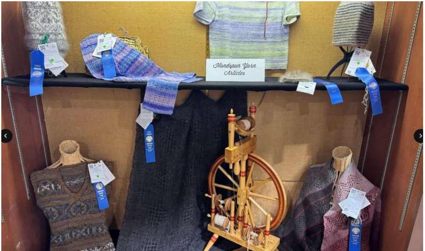
Handspun Yarn Articles Ribbon Winners