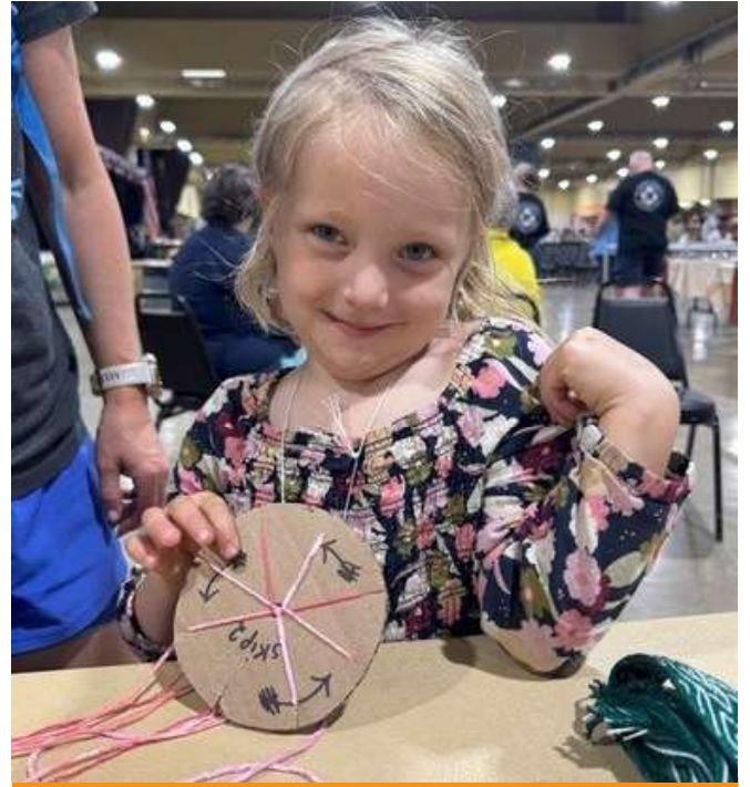
Make And Take friendship bracelet