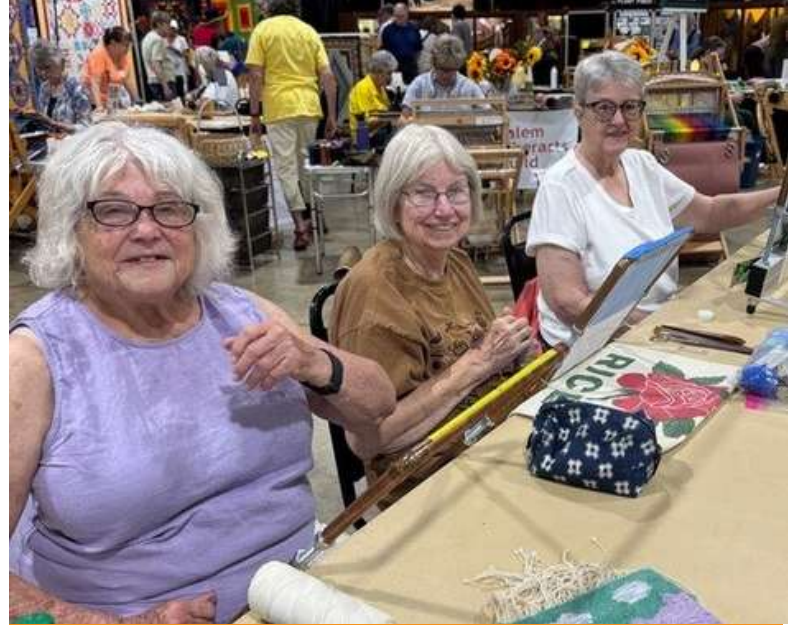
Damascus Fiber Art School Tapestry demonstrators