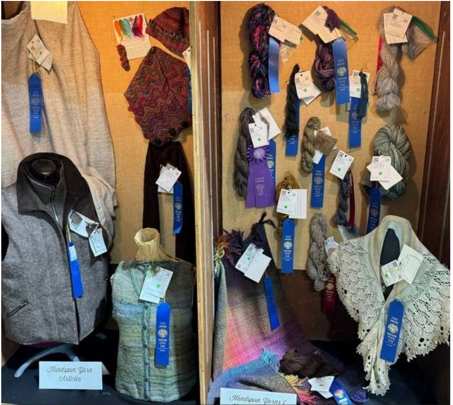
Ribbon Winners: Handwoven Articles on the left, Handspun Yarn and Yarn Articles on the right