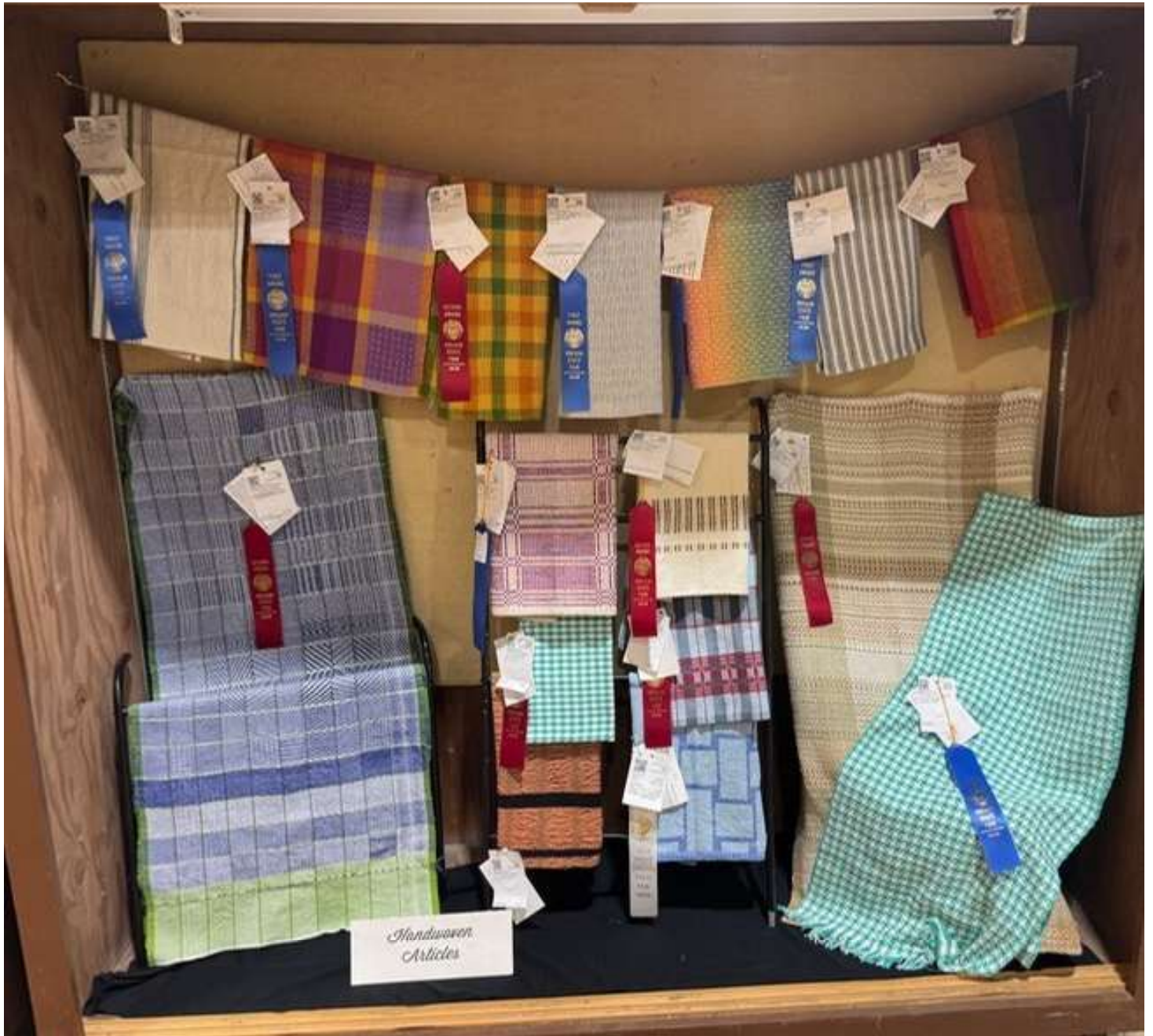
Handwoven Articles Ribbon Winners