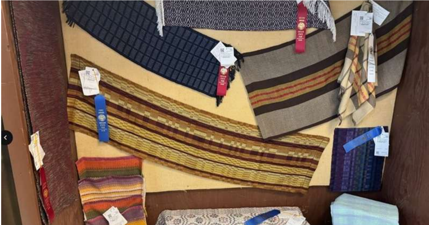
Ribbon Winners: Handwoven Articles