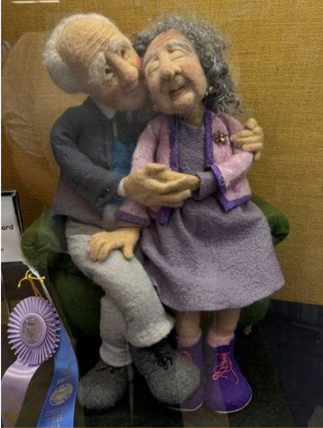
Best Needle Felted Article