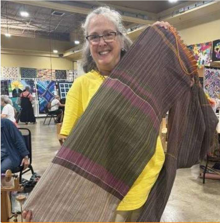
Off the loom