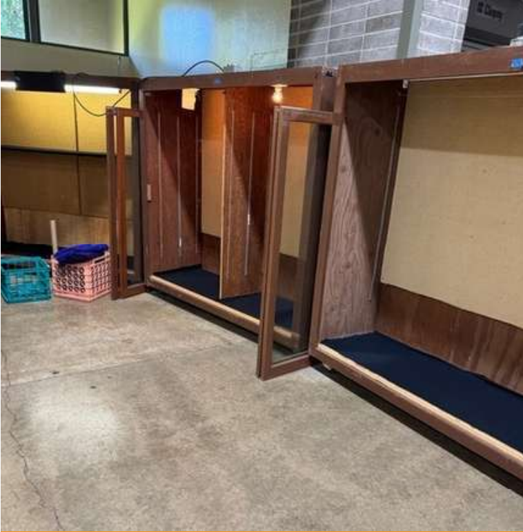
Empty cases ready for the Team